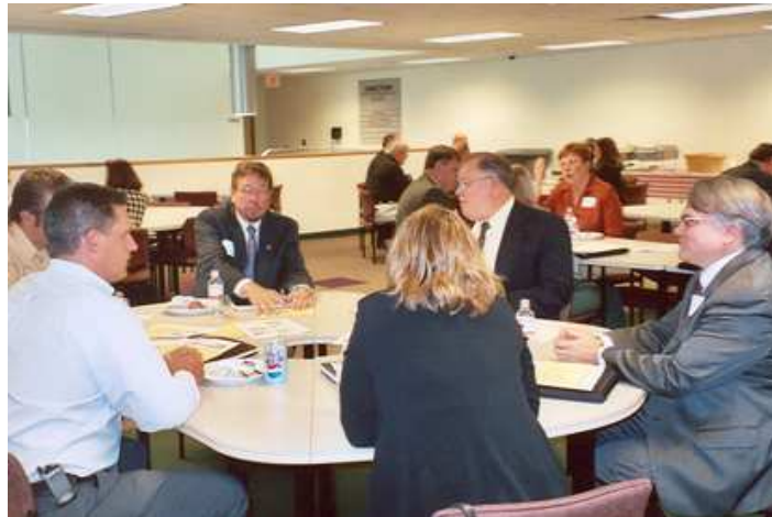
ABOVE During lunch, a group tackles one of the transportation issues assigned to the tables for discussion.

RLA attendees, and other regional leaders, were encouraged to build collaborative relationships to better advocate for transportation improvements and innovations that can benefit all Southwest Michigan